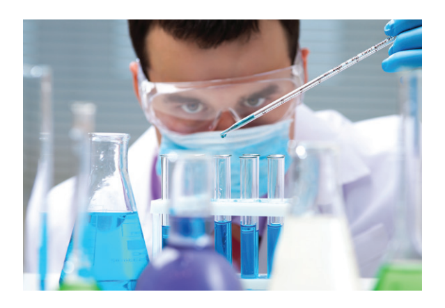
Visit Us Online: www.riccachemical.com

customerservice@riccachemical.com (888) GO-RICCA (467-4222)